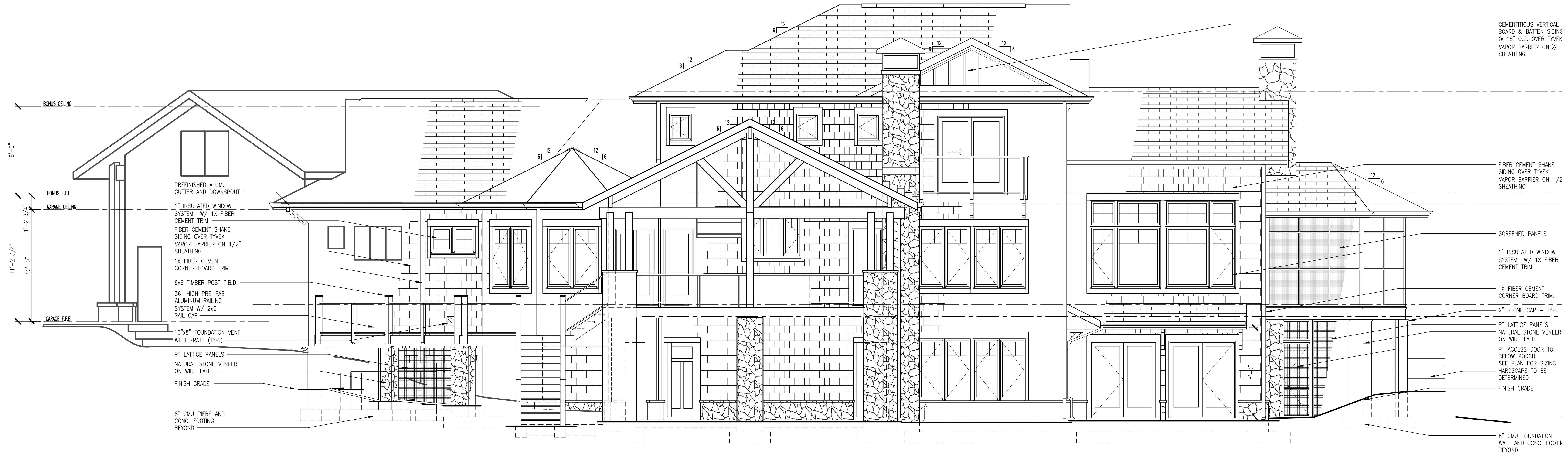
1 Front Elevation A-5